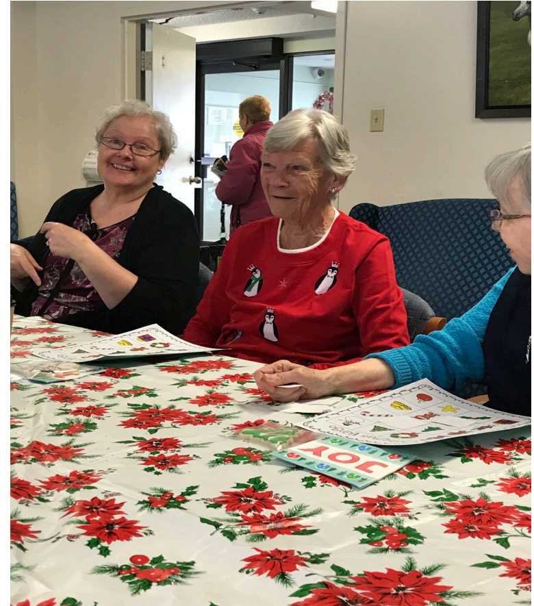
North View Court, Town of Georgina