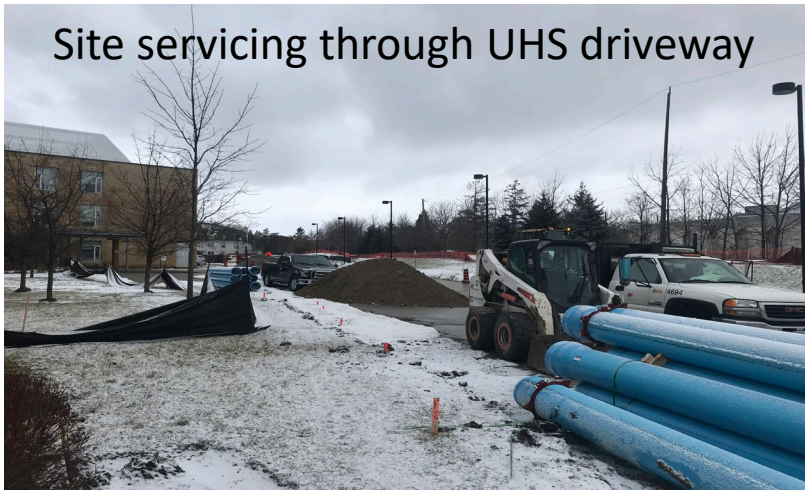
Site servicing through UHS driveway