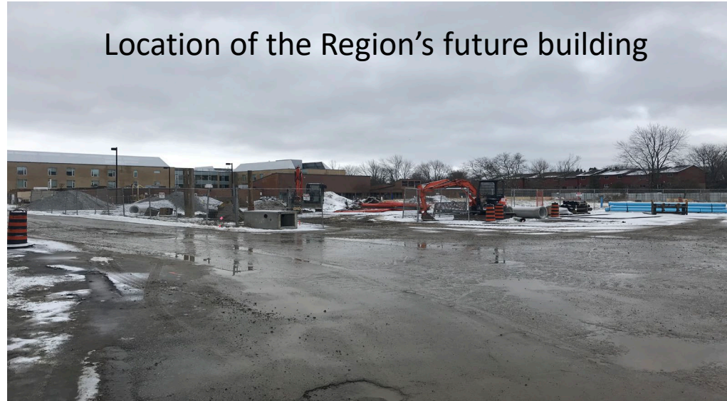
New UHS parking lot, which facilitated moving the parking off site for construction