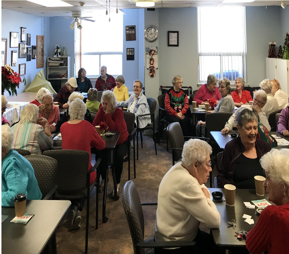
Keswick Gardens, Town of Georgina