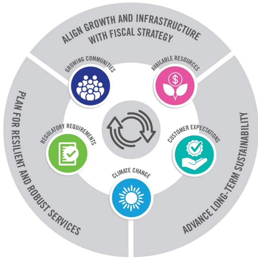
Figure 2 Master Plan Update Reflects Changing Needs