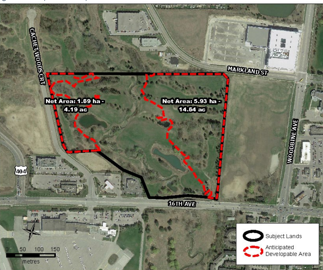
Figure 2. Anticipated Developable Area

A detailed assessment of on-site environmental features will have to be conducted through an Environmental Assessment to refine the boundaries of environmental features and assess the developable area of the Subject Lands and will be undertaken as required to support a future development application.