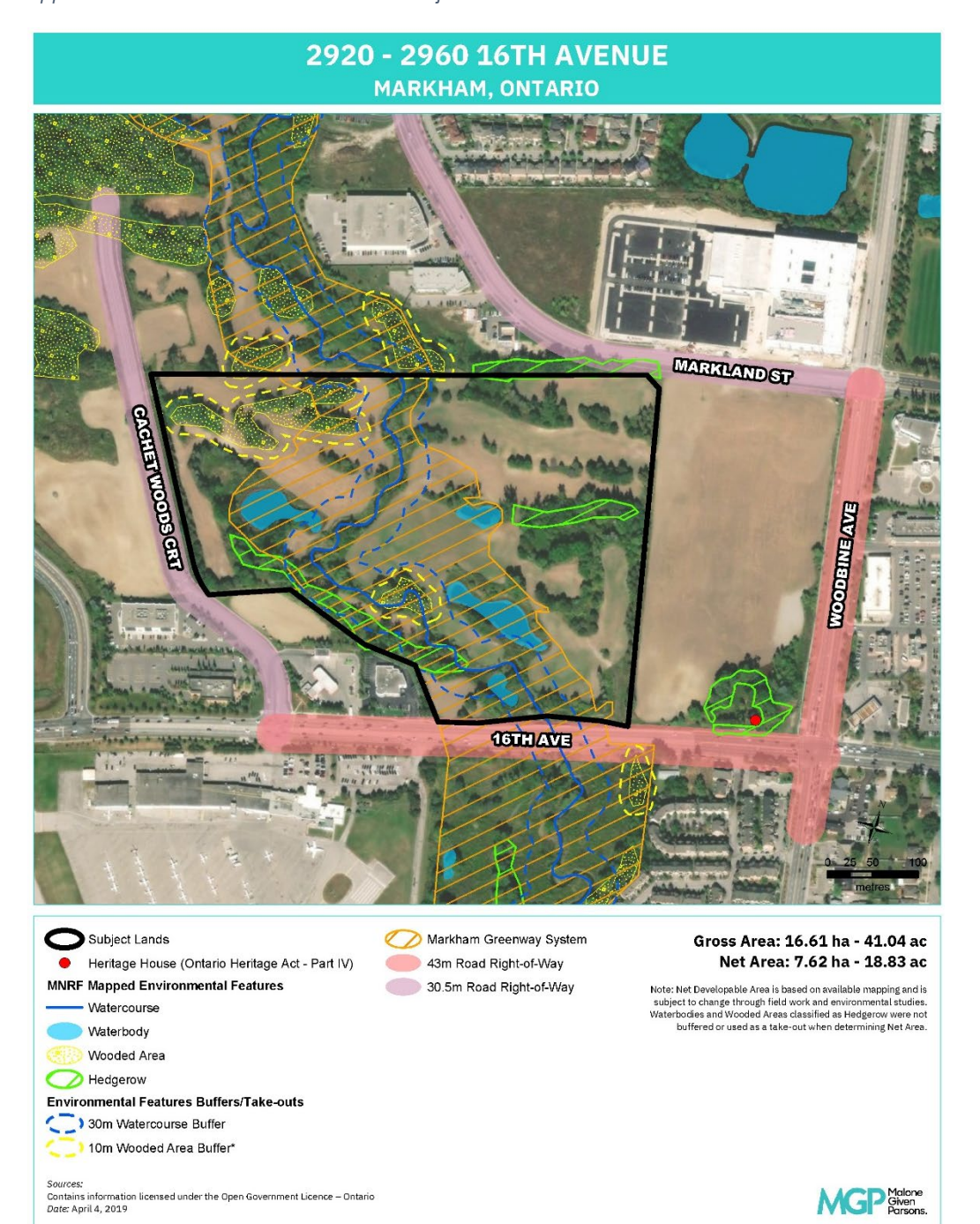
Appendix 1. Environmental Features on Subject Lands