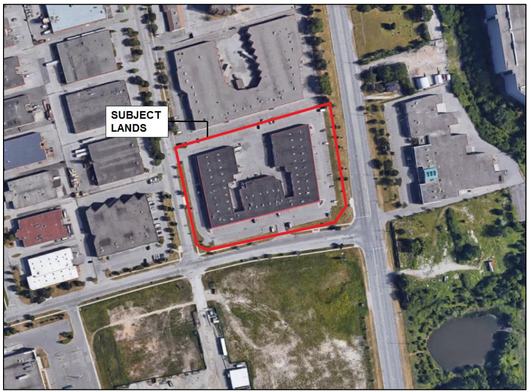
Figure 1: Aerial Photo of the Subject Property

The subject property is located at the northwest corner of Portage Parkway and Jane Street, immediately bordering the Vaughan Metropolitan Centre Secondary Plan Area to the south. It consists of 28 employment-related condominium units and has an approximate lot area of 19,288 square metres (1.92 ha) in a rectangular shape. The subject property has frontage onto three separate public roadways, including Jane Street (124 m), Portage Parkway (160 m) and Millway Avenue (113 m). The site is further located approximately 457 metres walking distance north of the Vaughan Metropolitan Centre ("VMC") Subway Station, which is the northern terminus of the TTC Spadina Subway Extension (Line 1), and 156 metres walking distance from the SmartCentres Place Bus Terminal (refer to Attachment 2). Further, the property is adjacent to the Jane Street / Portage Parkway intersection on its eastern property line and the Millway Avenue / Portage Parkway intersection at the southwest corner giving the property direct pedestrian access to the subway station.