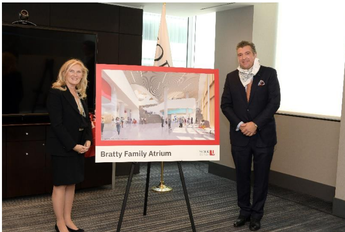
October 2020 – Bratty Family announces a donation of $10M to the campus