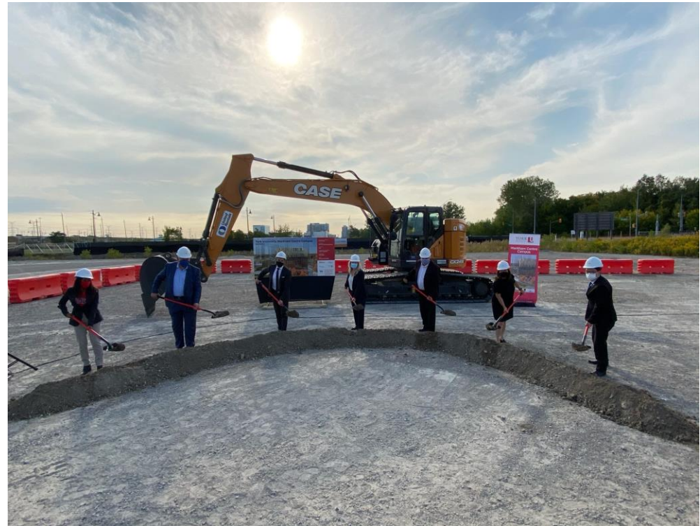
September 2020 – Official Ground Breaking