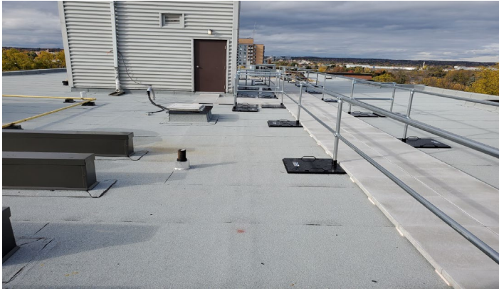
Maplewood Place, Town of Richmond Hill