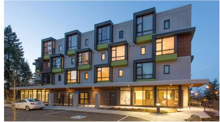
Uplands Walk, Nanaoimo, BC

A four story building containing 33 supportive housing units