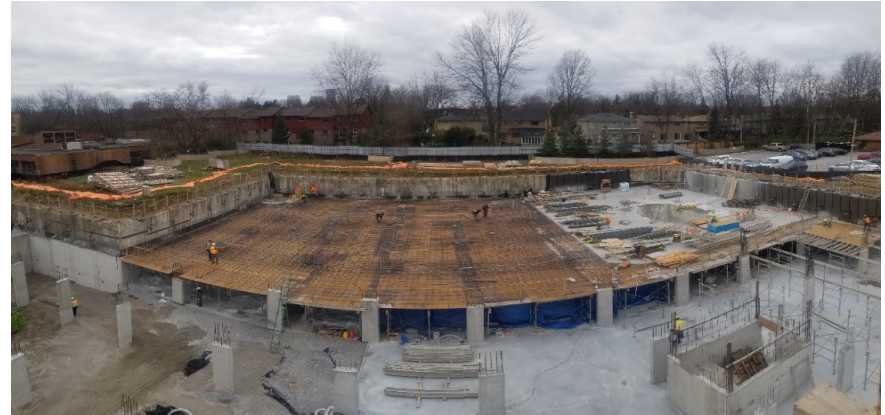
View looking west