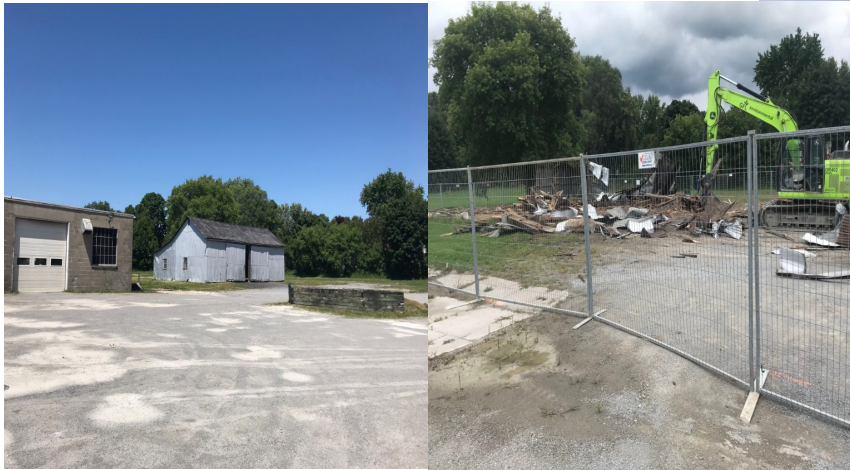
Demolition of existing buildings