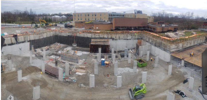
View looking south with Unionville LTC behind