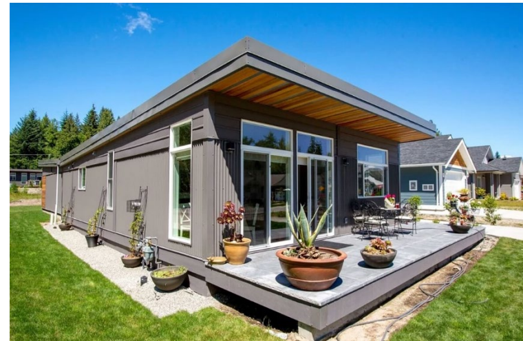
Single Detached Modular House

A four story building containing 33 supportive housing units