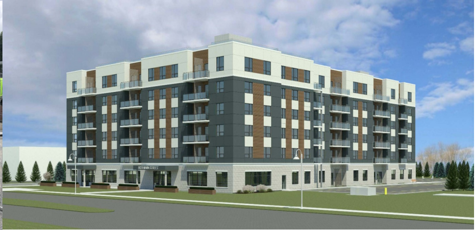
Rendering looking north from Main Street