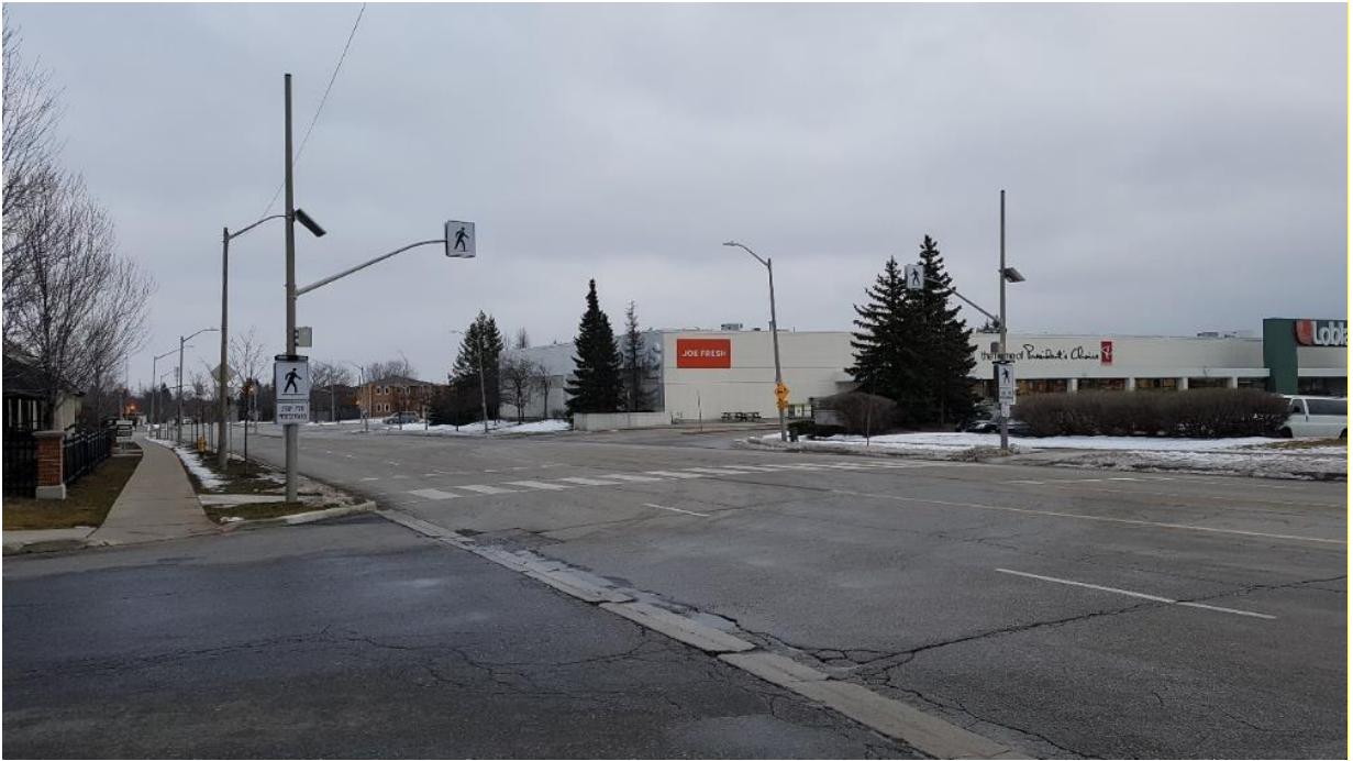
Bernard Avenue east of Yonge Street, City of Richmond Hill