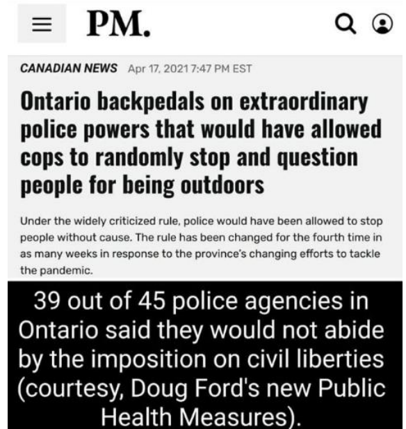
Figure 1: Refer appendix, URL Source-1

So, contrary to what Doug Ford caught saying in a 'hot mic' event ("no politician in this country that's gonna disagree with their Chief Medical Officer , that just aren't gonna do it. They might as well throw a rope around their neck and jump off a bridge"), advocating for what is right resonates with the people and is the politically right thing to do as evidenced by the actions of the police agencies.