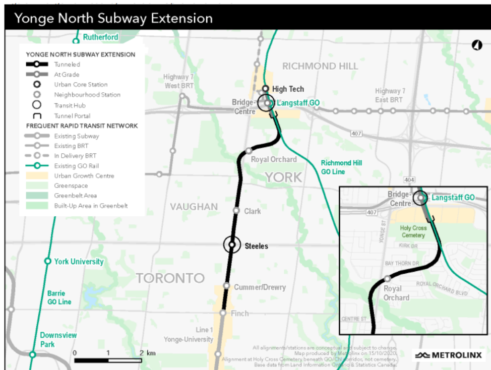
Figure 3: Refined Option 3 Subway Alignment

The refined Option 3 alignment is approximately 150 m longer than what was presented in the IBC. The alignment refinement applies to the section that curves away from Yonge Street to the proposed subway tunnel portal north of Langstaff Road. The refined alignment continues to allow for four stations within the project funding envelope and crosses diagonally through the Royal Orchard community under several homes and community spaces.