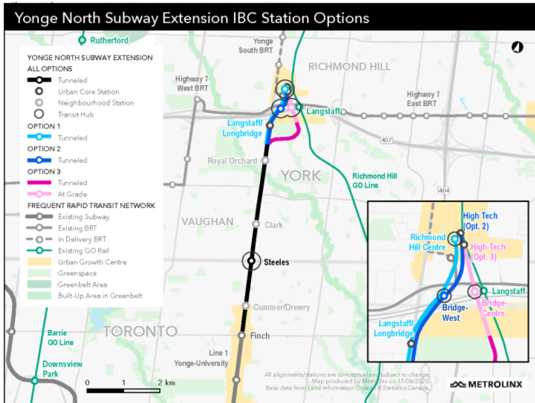
Figure 2: Subway Alignment Options from Metrolinx Initial Business Case

The initial business case identifies that Option 3 alignment maximizes the benefits of the extension while achieving the lowest cost for the minimum project scope, including three stations, and one Neighbourhood Station.