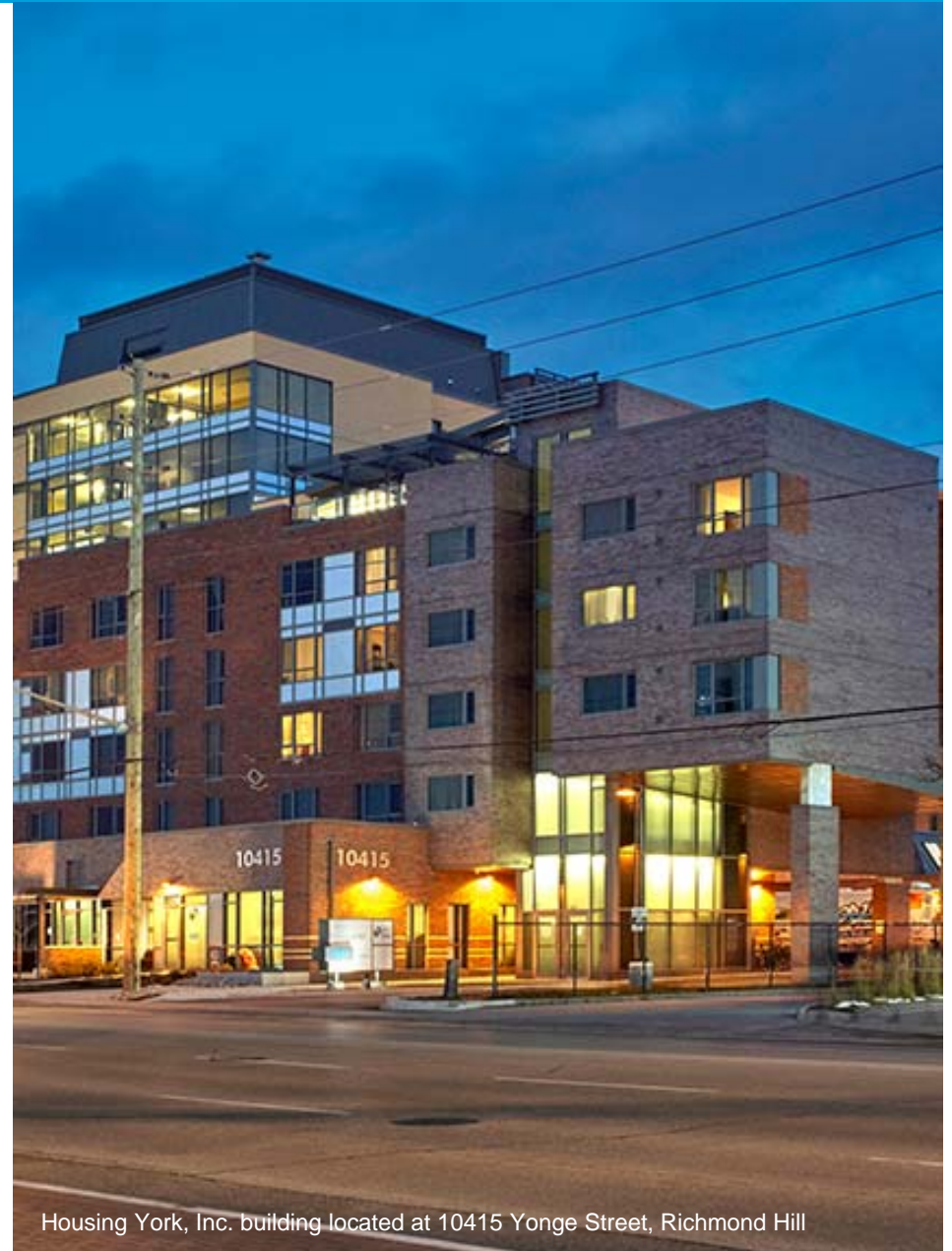
Housing York, Inc. building located at 10415 Yonge Street, Richmond Hill