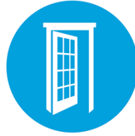
Homelessness Community Programs