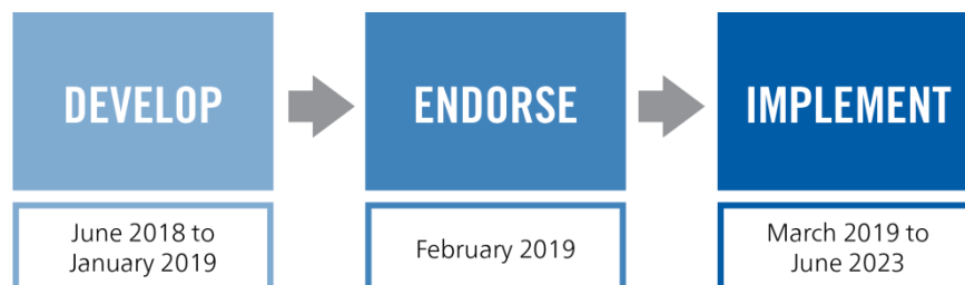
Figure 3 Corporate Strategic Planning Process

Following Council endorsement of the Strategic Plan the strategic planning process shifts from development to implementation, monitoring and reporting on progress.