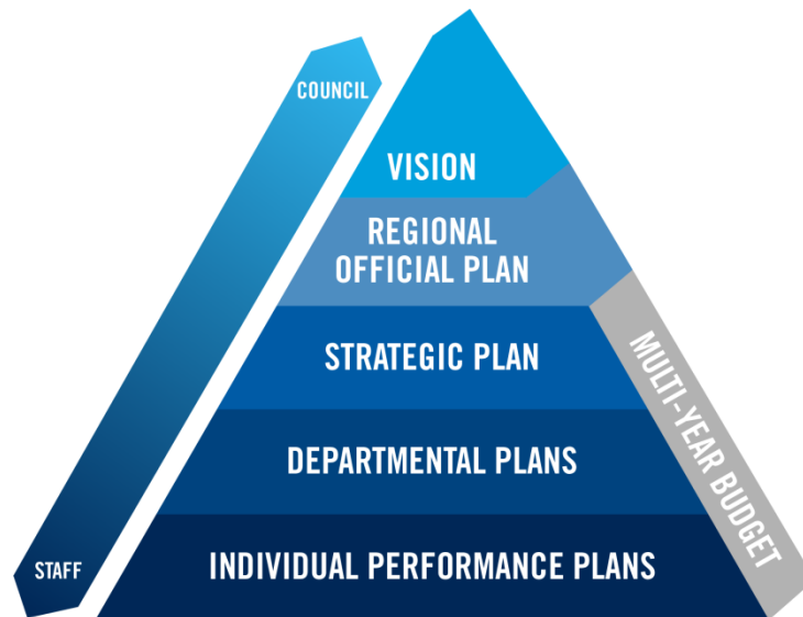
Figure 2 Accountability Matters