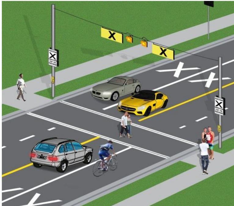
Figure 1 Level 1, Type 1 Pedestrian Crossover