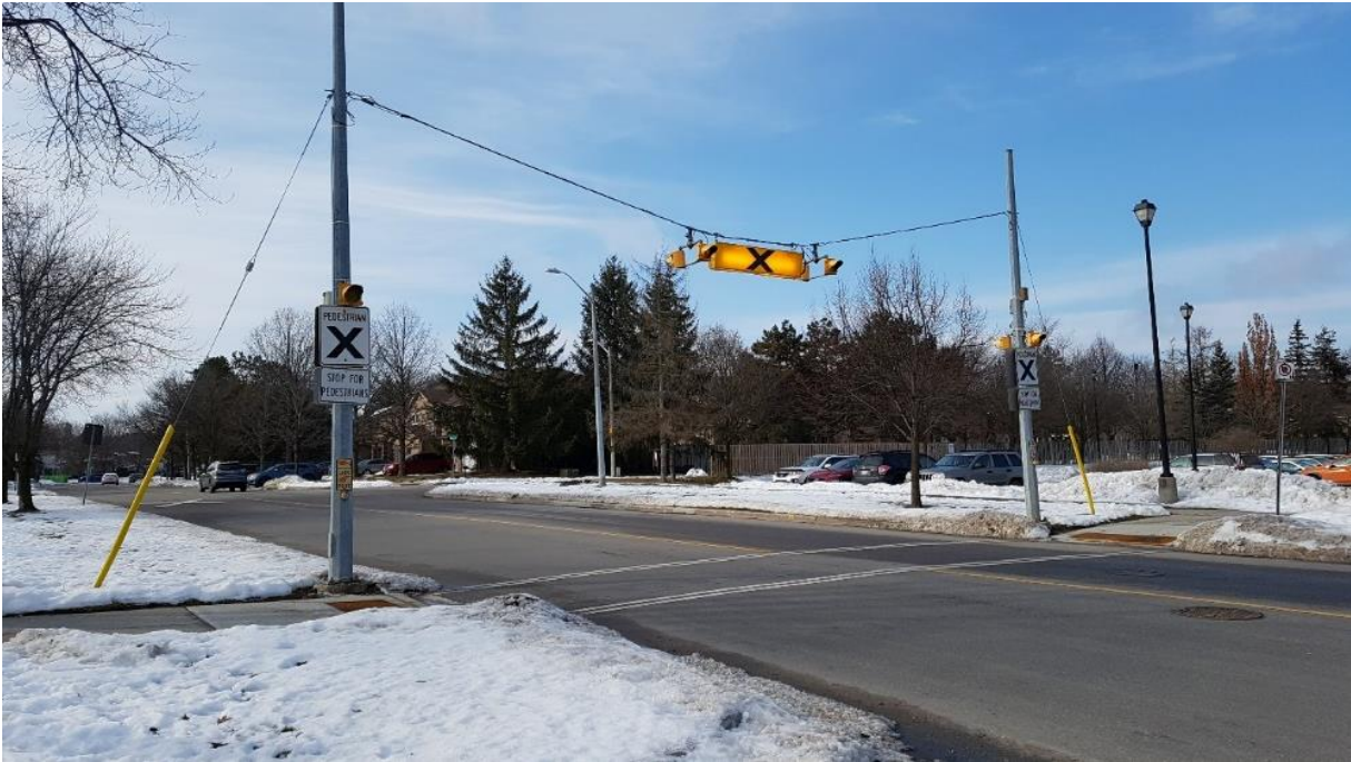
Orchard Heights Boulevard west of Yonge Street, Town of Aurora