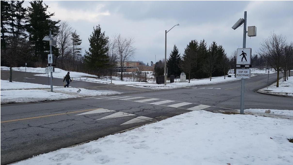
Shaftsbury Avenue and Casa Grande Street, City of Richmond Hill