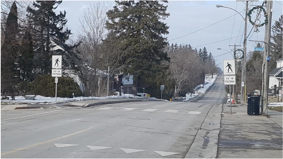
Centre Street at Mill Street, Town of East Gwillimbury