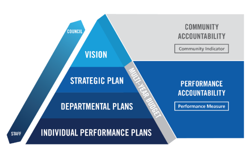
Figure 1 Corporate Performance Management Framework

Vision also serves as a guiding document for the Region's provincially mandated plans such as the Regional Official Plan and the Community Safety and Wellbeing Plan.