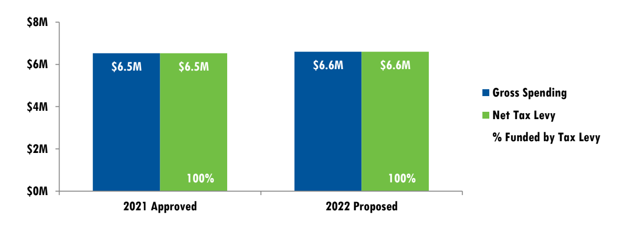
Figure 1 2022 Gross and Net Operating Expenditures

The Conservation Authority budget includes funding for the Toronto and Region Conservation Authority and the Lake Simcoe Region Conservation Authority. The 2022 proposed gross operating expenditures for Conservation Authorities are $6.6 million, or 0.2% of total Regional expenditures. The proposed 2022 net expenditures of $6.6 million are 0.5% of the total. Operating expenditures for the Conservation Authorities are 100% funded by tax levy as shown in Figure 1 below.