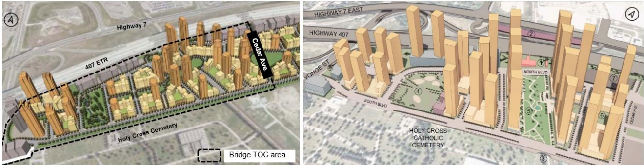
Bridge TOC Proposal

Table 2 compares the revised High-Tech TOC proposal with statistics derived from the draft Richmond Hill Centre Secondary Plan policy framework. Figure 4 shows renderings of development concepts for the draft Secondary Plan and High-Tech TOC proposal.