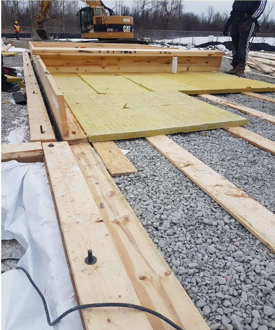
Rigid insulation and vapour barrier