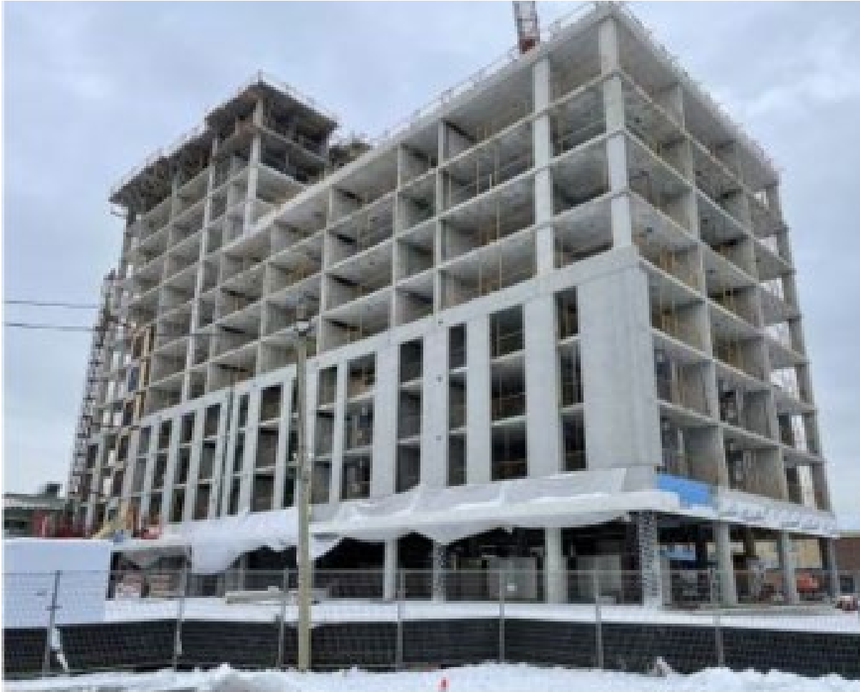
Unionville Commons, City of Markham