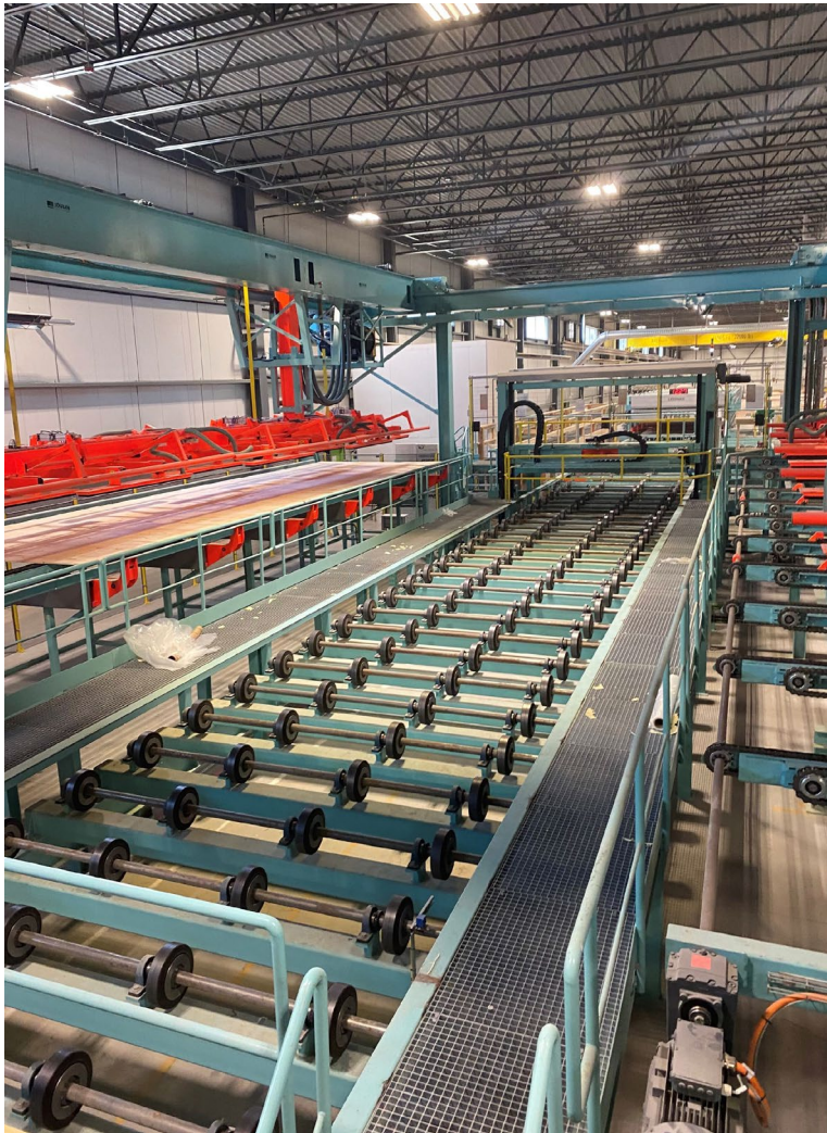
Cross-laminated timber Wall modules – fabrication line