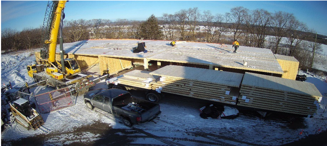
Cross-laminated timber modular wall and floor panels