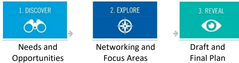
Figure ##: Consultation and Engagement Milestones