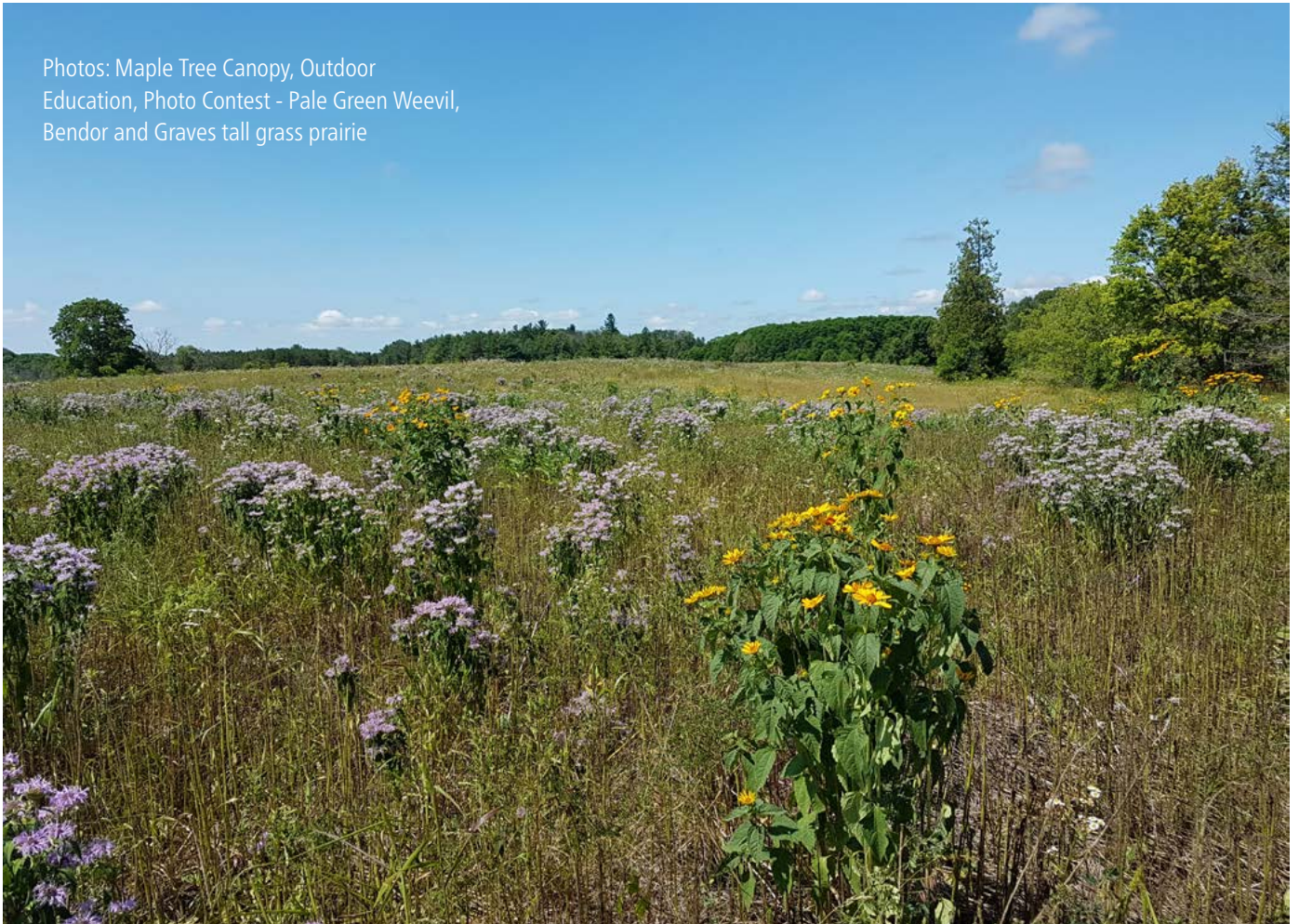
Photos: Maple Tree Canopy, Outdoor Education, Photo Contest - Pale Green Weevil, Bendor and Graves tall grass prairie