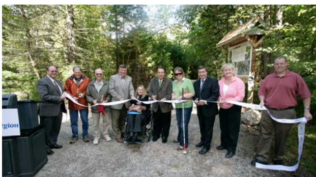
Photos: Picking the best trees for street tree planting, 2016 Field Tour—street tree and horticulture, Structural soil installation on Donald Cousens Parkway Fall 2009, Accessible Trail in Hollidge Tract Ribbon cutting for opening of YRF first Accessible Trail-September 20, 2010