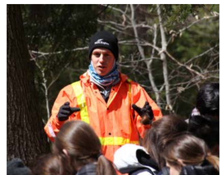
Photos: Sustainable timber harvest, Ontario Turtle Conservation Centre staff representative holding a snapping turtle - 2017 Spring Forest Festival - YR forest photo contest, Water in a low area on a cold winter day - YR forest photo contest, 2016 Envirothon