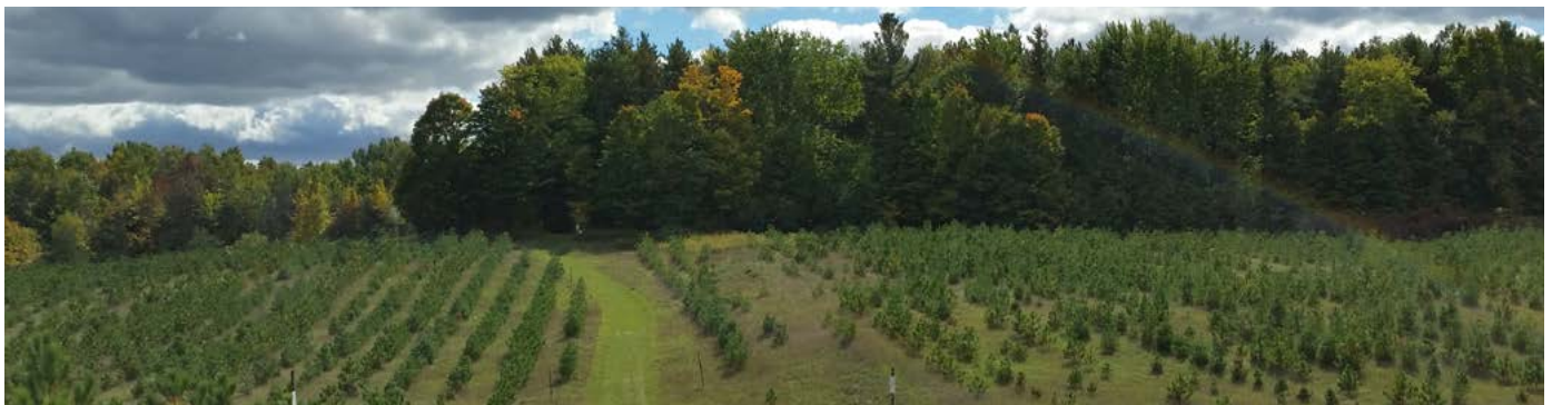
Photos: Bill Fisch Forest Stewardship and Education Centre, Bendor and Graves Reforestation

In 2018 the unique and inspiring Bill Fisch Forest Stewardship and Education Centre in the York Regional Forest became the first building in Canada and only the twenty-first in the world to be certified under the Living Building Challenge. The certification assesses a building’s performance from the perspectives of site, water, energy, health, materials, equity and beauty. The building previously received Leadership in Energy and Environmental Design (LEED®) Platinum certification. Its innovative features include all-wood construction using Forest Stewardship Council certified or recycled wood; solar panels, LEDs, heat pumps, and triple-glazed windows that allow the building to generate more energy than it uses; and water supply from rain and snow melt.