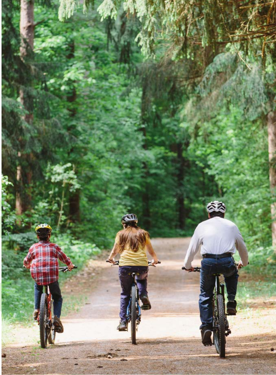
Family fun in the forest