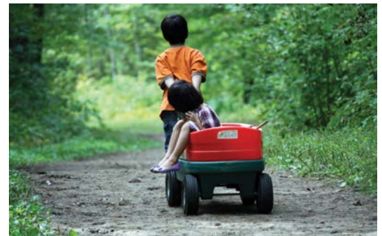
Photos: Discover your forest kit - Social media post, L.E.A.F. National Tree Day Marita Park 2014, Enjoying time together in the forest. YR forest photo contest