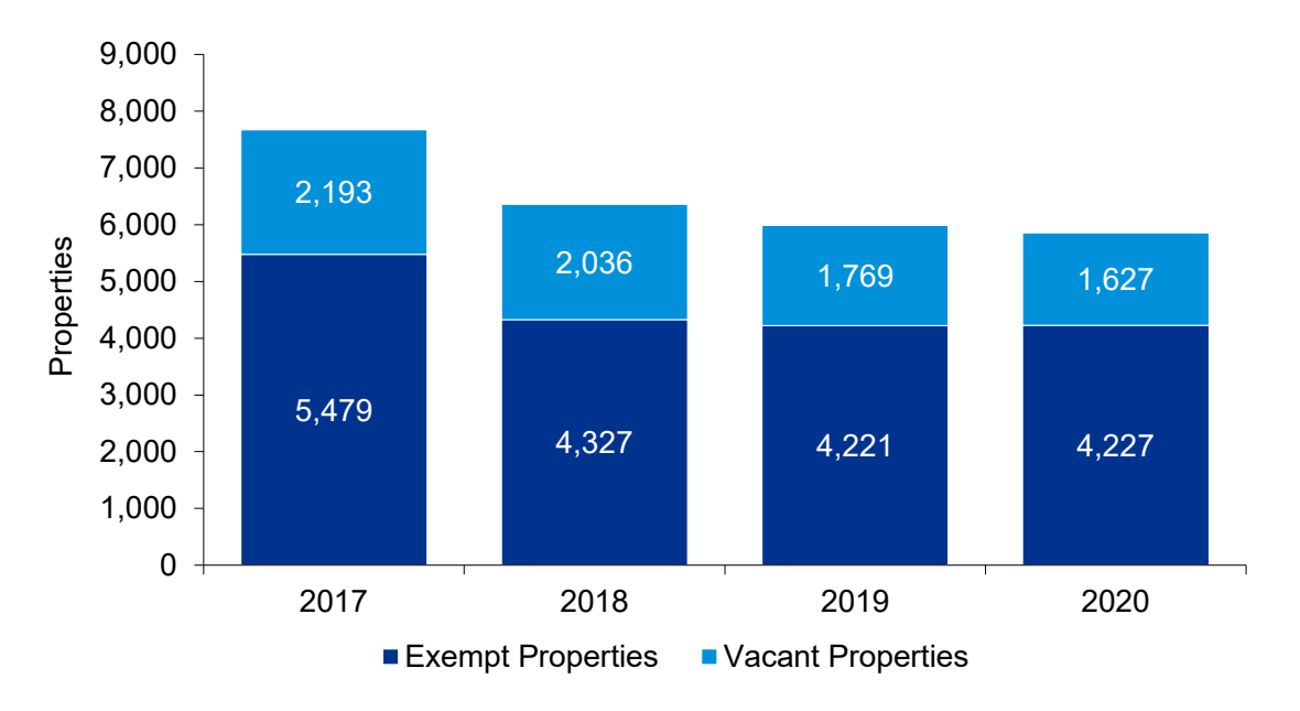
Figure 5: Vacant and exempt Vancouver residential properties subject to the EHT

Although any revenues generated by the EHT were intended to be a secondary benefit of the tax, the City raised approximately $38.0 million, $39.4 million, $36.0 million and $26.0 million from the tax in years from 2018 to 2021, respectively. The City noted that revenue decreased in 2021 as more vacant homes were