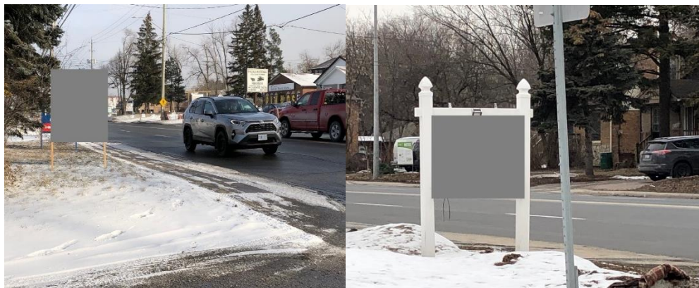
Figure 1 Examples of Signs Impeding Sightlines

In 2022, the Region and some local municipalities partnered sporadically to manage signs on Regional roads as resources permitted at a total cost of about $265,000. Costs have been increasing since the last bylaw update in 2015.