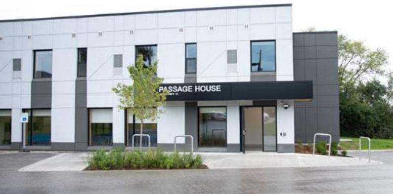
Passage House transitional housing in the Town of East Gwillimbury