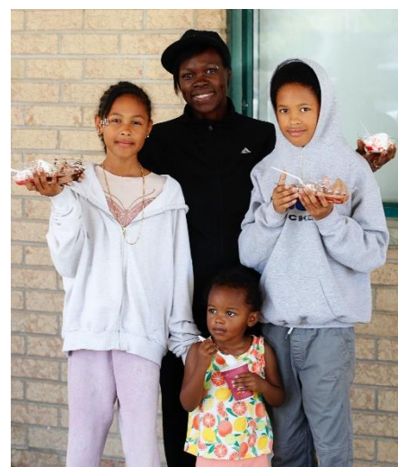
A family enjoys ice cream at the Heritage Village East resident event in Newmarket