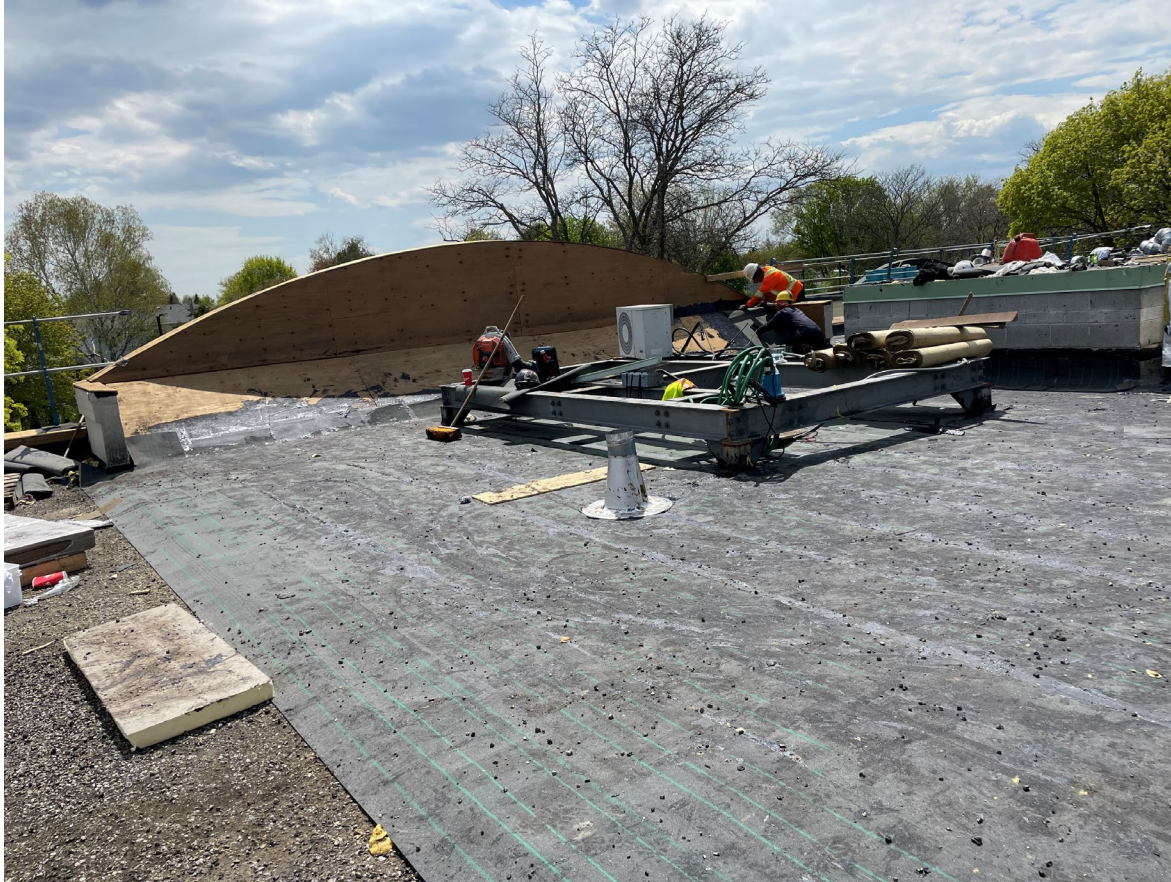
Roof replacement – Armitage Gardens Town of Newmarket