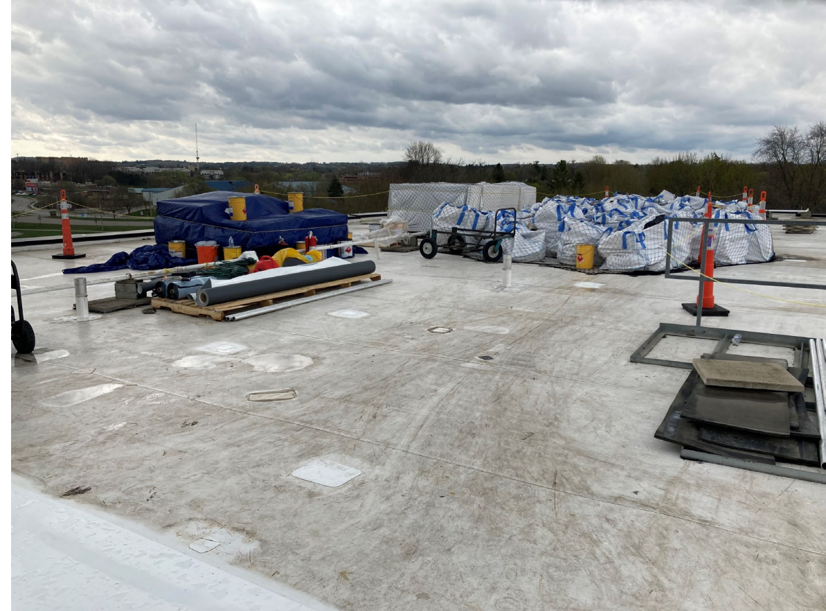
Roof replacement – Orchard Heights Town of Aurora