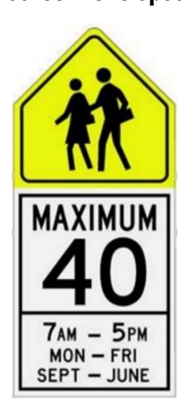
Figure 1 Time-Based School Zone Speed Limit Sign

To promote consistency, simplify understanding for motorists and simplify enforcement efforts, a Region-wide 10 km/h Speed Limit reduction will be applied to school locations, using the time-based school zone maximum speed sign. The reduced Speed Limit at all locations will be in effect from 7 am to 5 pm, Monday to Friday, September to June.