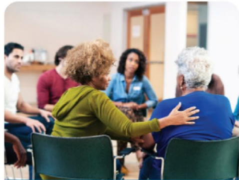
Support for Caregivers