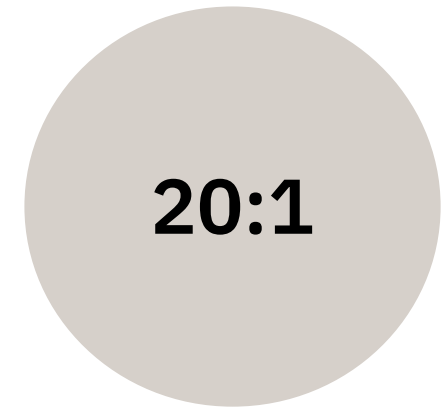
ROI on Program Funding