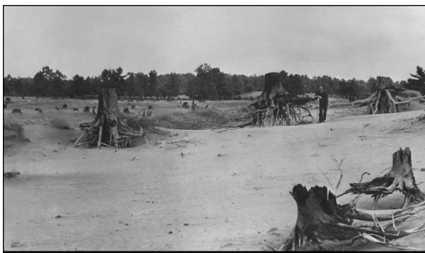
Sand blown out from under pine stumps