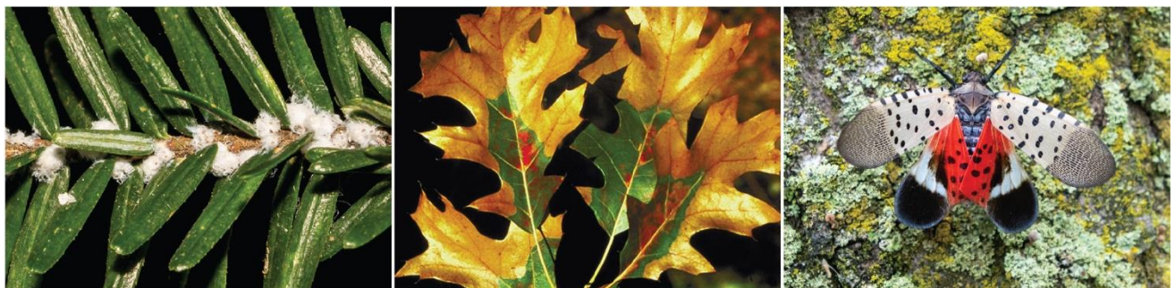
Hemlock woolly adelgid