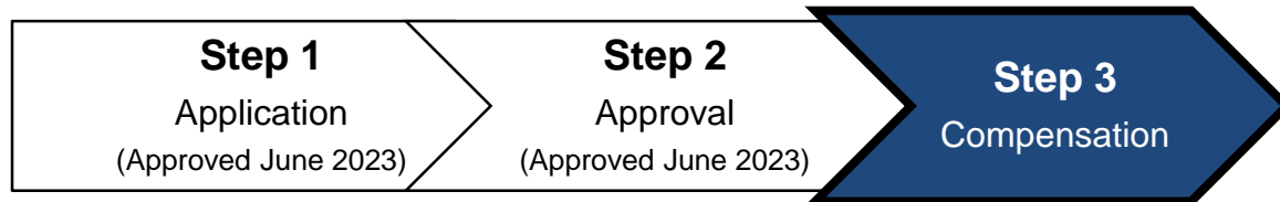
Figure 1 Council Approval Steps

This report requests Council authorization to issue offers of compensation to owners whose properties are the subject of this report. This is the third of three steps in the Council approval process for property expropriation, as indicated in Figure 1.