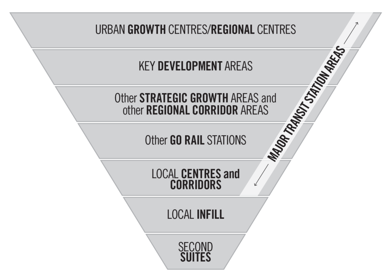
Figure 3 York Region Intensification Matrix

Intensification in strategic locations maximizes efficiencies in infrastructure delivery, human services provision and transit ridership. Under the ROP, strategic locations are based on an intensification framework that recognizes the primacy of the Regional Centres in accommodating the highest density and scale of development. The updated intensification matrix in Figure 3 sets out strategic locations for intensification within the Region. Major transit station areas can be located within a number of the components of the matrix as shown below.