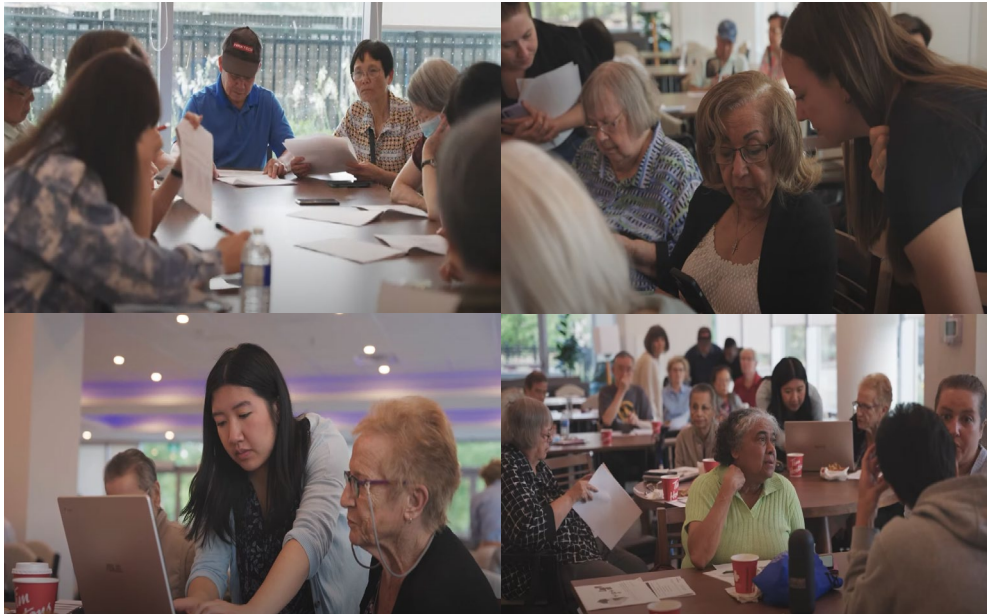
Seniors Wellness Program Unionville Commons, City of Markham

Resident engagement programs support successful tenancies