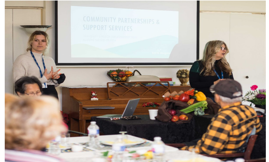
Financial Empowerment Workshop Fairy Lake Gardens, Town of Newmarket