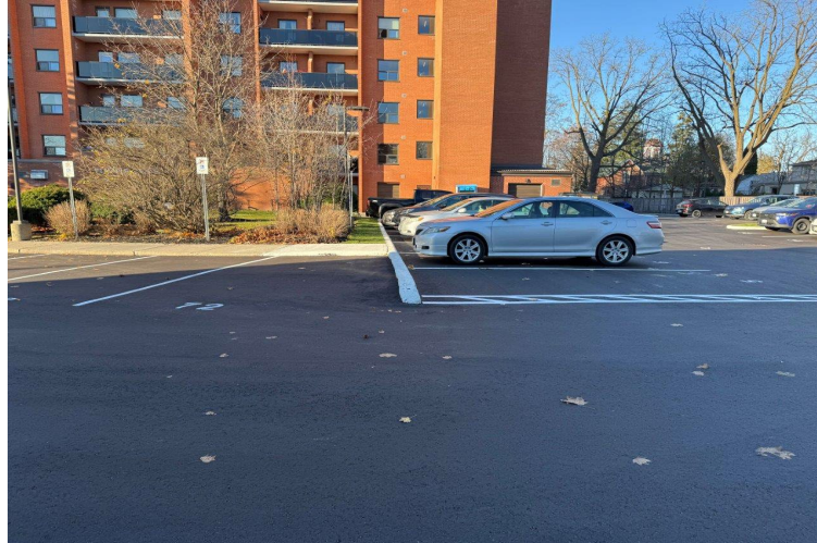
Parking lot replacement Maplewood Place, City of Richmond Hill