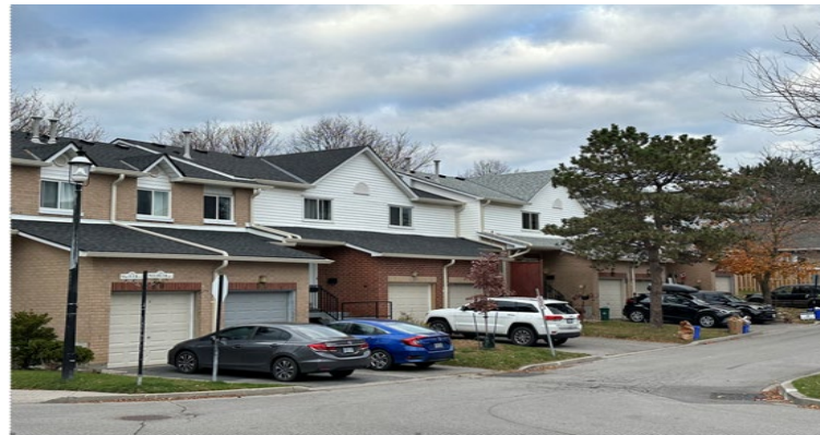
Roof downspout and eavestrough replacement Mulock Village, Town of Newmarket