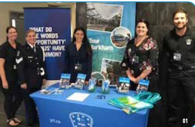
01 Transit Special Constables Women's Symposium