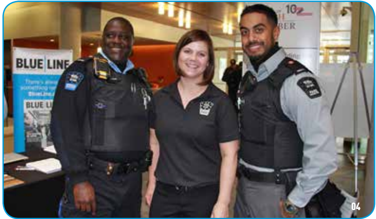
01 Recruitment Outreach – ABLE Job Fair